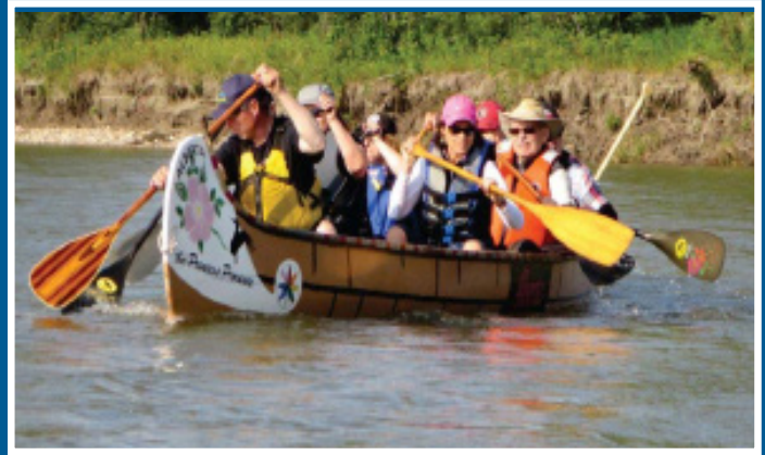
Headwaters Tour in 2016