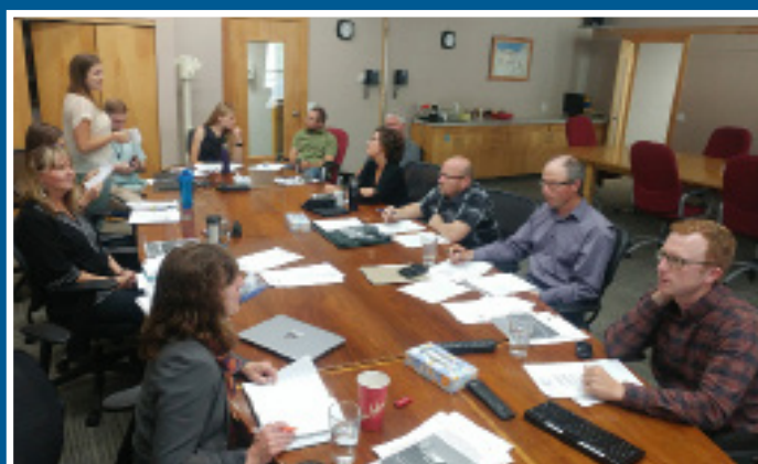
Meeting of Technical Advisory Committee for the Headwaters Alliance