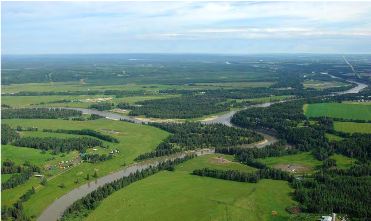
Clearwater River and North Saskatchewan River near Rocky Mountain House, Alberta

The Executive Directors of all WPACs meet quarterly to discuss mutual progress, operational concerns and to organize the Annual WPAC Summit. The NSWA actively contributes to discussions regarding watershed planning mandates and capacities in Alberta, and has positioned itself to contribute to forthcoming planning activities under the Land Use Framework.