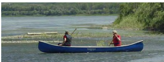
North Saskatchewan River near the mouth of the Vermilion River