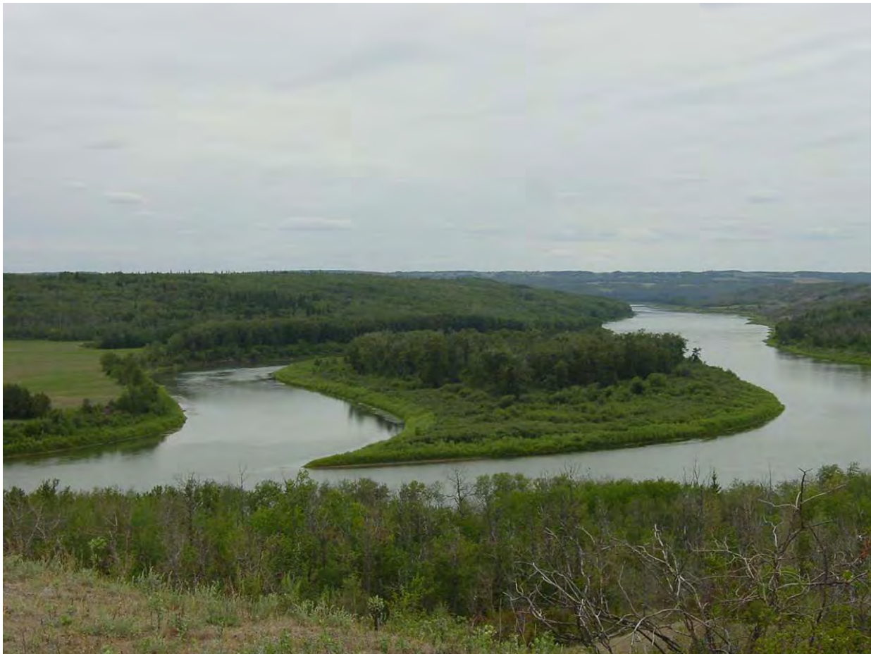
Hair Brush island in the North Saskatchewan River near Lindbergh, Alberta